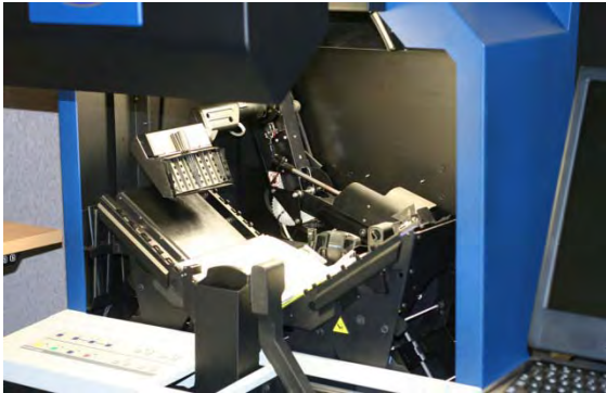
Kirtas Book Scanner