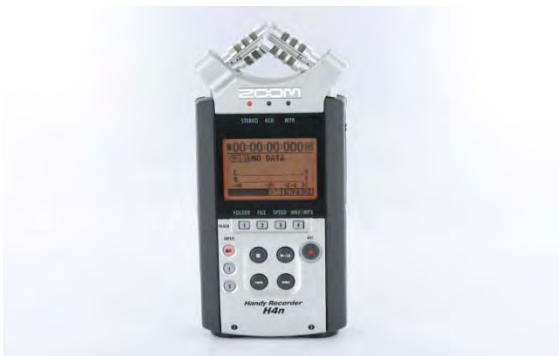
Digital Audio Recorder