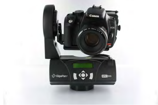
Gigapan & Camera